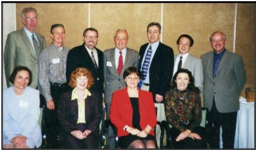
IAAER Executive Committee in Athens