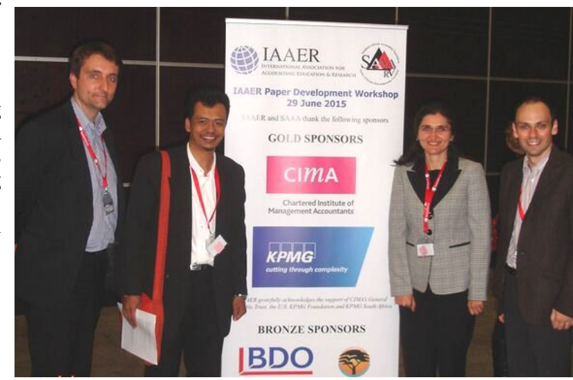
Deloitte Scholars at the SAAA / IAAER Paper Development Workshop

Accounting research is relatively young in South Africa and the benefit gained from a conference such as this in terms networking with peers, establishing new contacts and sharing information, experiences and challenges with local and international scholars is invaluable.