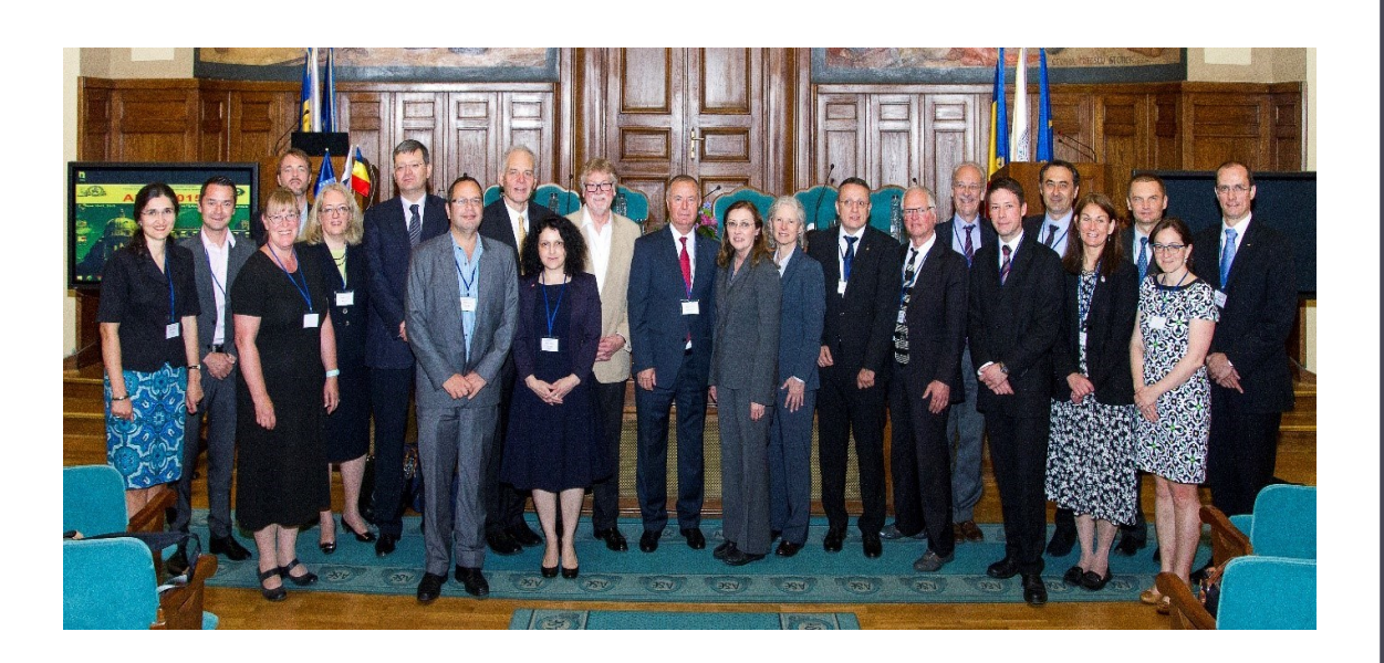
AMIS International Committee and Guests